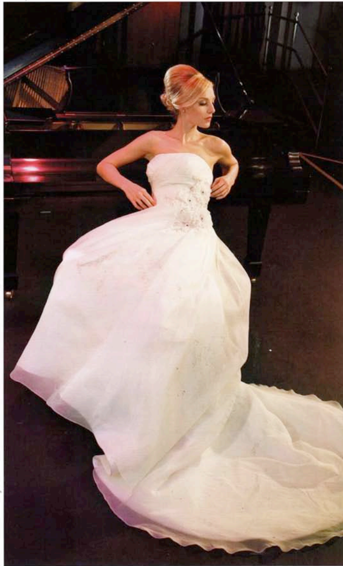
Alita Graham for Kleinfeld Kollection Organza Strapless A-Line Gown with Empire Waist

You'll know it's "the one." If you have to be reassured that the gown looks great on you, it's probably not "the one." Is this how you pictured yourself looking as a bride? Does the gown suit your personality? Are you comfortable enough in it to enjoy your wedding day?